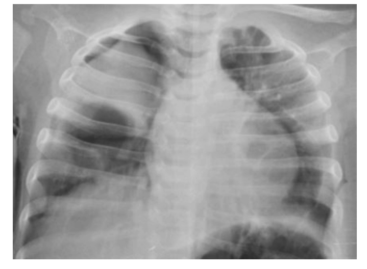
Figure 2. Posteroanterior chest X-ray after biphasic positive airway pressure support