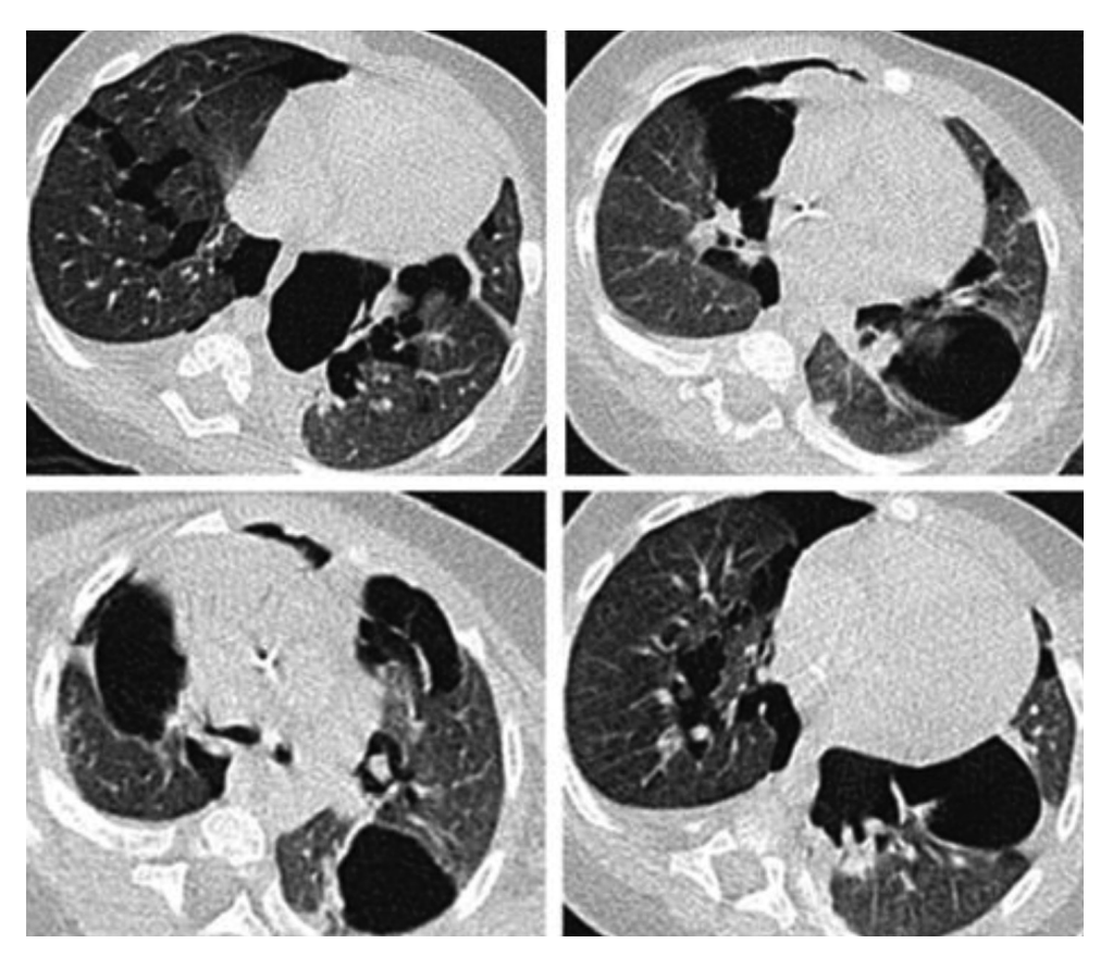
Figure 3. Computed tomography of thorax after biphasic positive airway pressure support