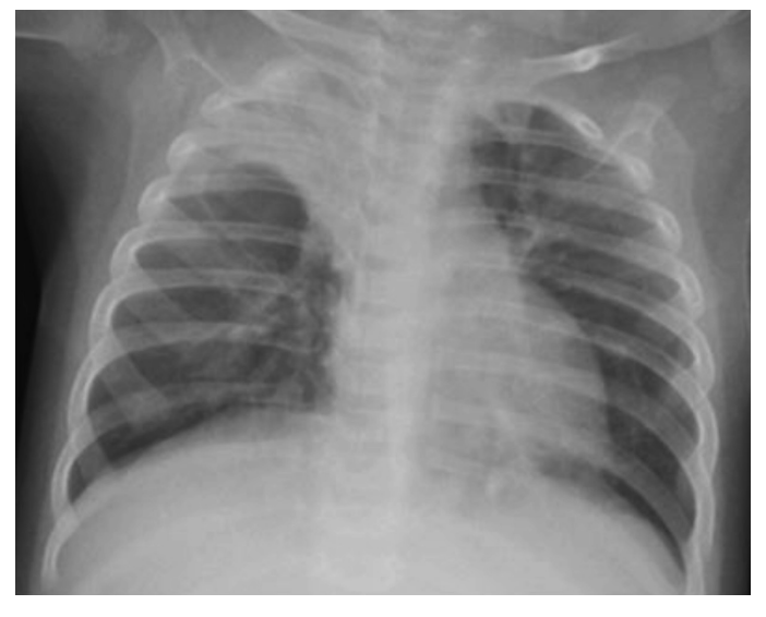
Figure 4. Posteroanterior chest X-ray taken two daysa after conlusion of biphasic positive airway pressure support

Informed consent was obtained from the patient's parents for publication of this case report.