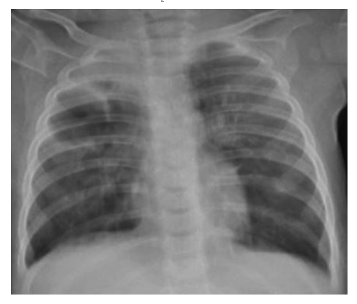
Figure 1. Posteroanterior chest X-ray at admission