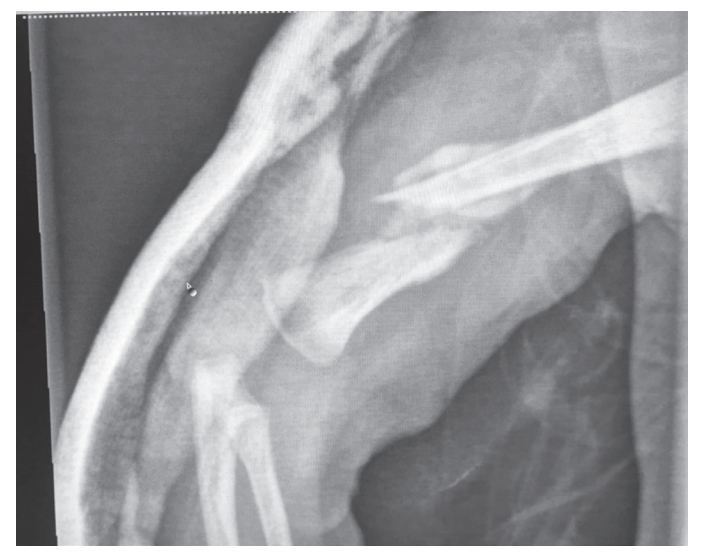
Figure 5. Healing of the fracture line