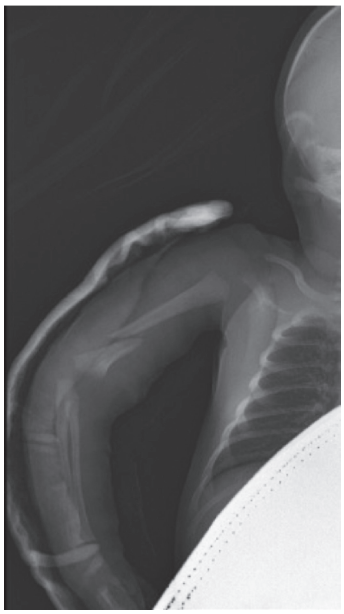
Figure 3. Right humeral shaft fracture and normal clavicle

In the ED, the right arm was casted, a long arm splint was placed on the right upper extremity (Figure 4), and the patient was discharged with a scheduled follow-up visit three weeks later. At three weeks, the patient did not have any motor and sensory disorders. At the final visit at six weeks, the fracture line completely healed without any limited mobility (Figure 5). The verbal consent was taken from the patient's parents.