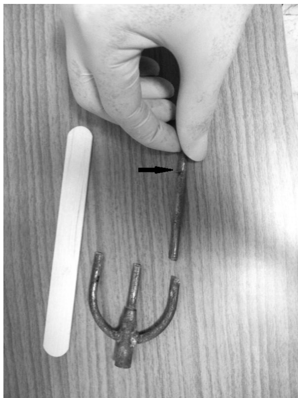
Figure 3. Photograph of the spear gun shaft and its barb (arrow) after removal from the patient.

that penetrates to maxillofacial region can be necessary as in ours (8, 10). This process has some risks for the patients. The vibrations of the cutter machine can increase parenchymal damage, so choosing the right cutter machine is important. Also imaging techniques should be performed to reveal extent of the penetration before the cutting process. We used a hydraulic cutter in our case because it causes less vibration.